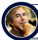
SPECIAL GUEST FRANÇOIS JULLIEN

The keynote speaker's presentation will be the starting point for discussions conducted as part of special sessions and individual sessions .